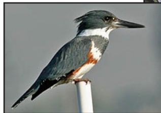
BELTED KINGFISHER