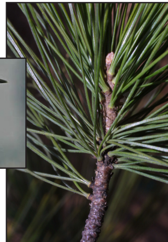
EASTERN WHITE PINE